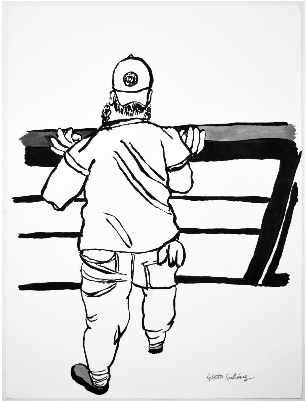
Untitled 8, 2022 Sumi ink on paper 30 x 22 in.