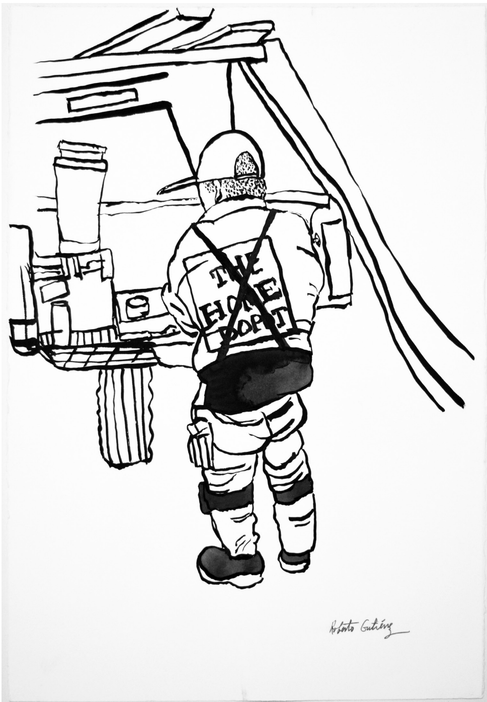
Untitled 1, 2022 Sumi ink on paper 30 x 22 in.