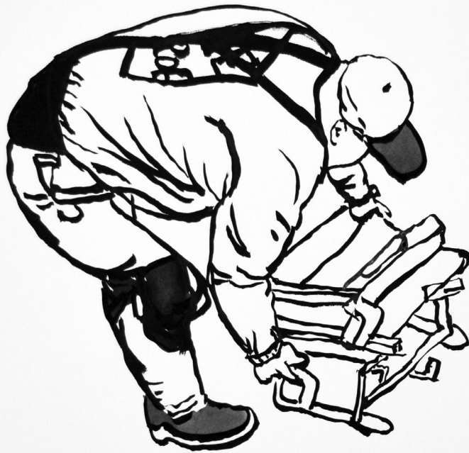
Untitled 12, 2022 Sumi ink on paper 30 x 22 in.