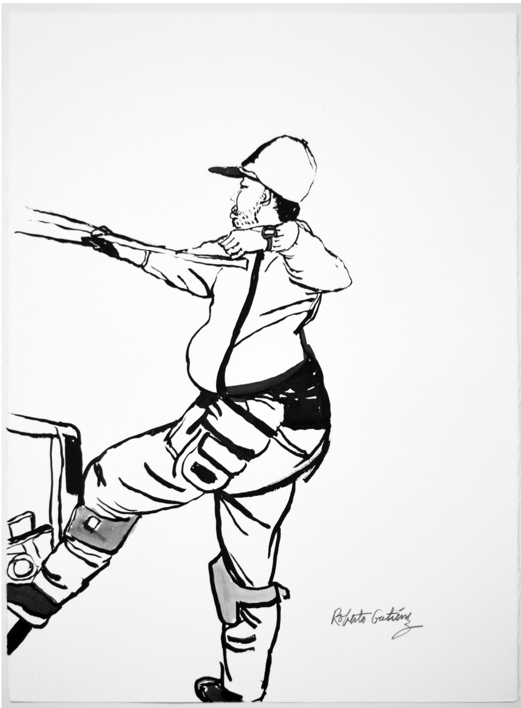
Untitled 11, 2022 Sumi ink on paper 30 x 22 in.