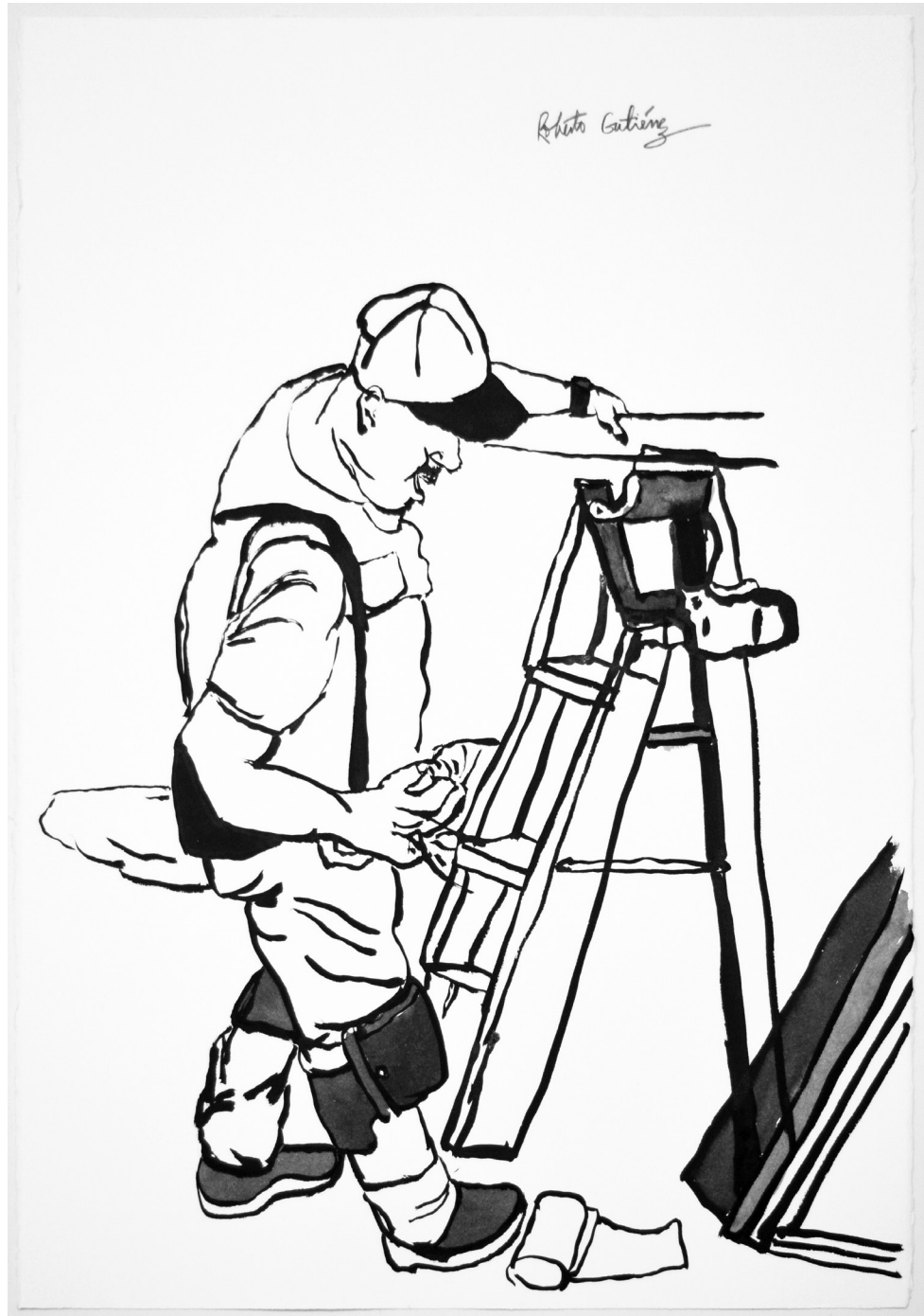
Untitled 4, 2022 Sumi ink on paper 30 x 22 in.