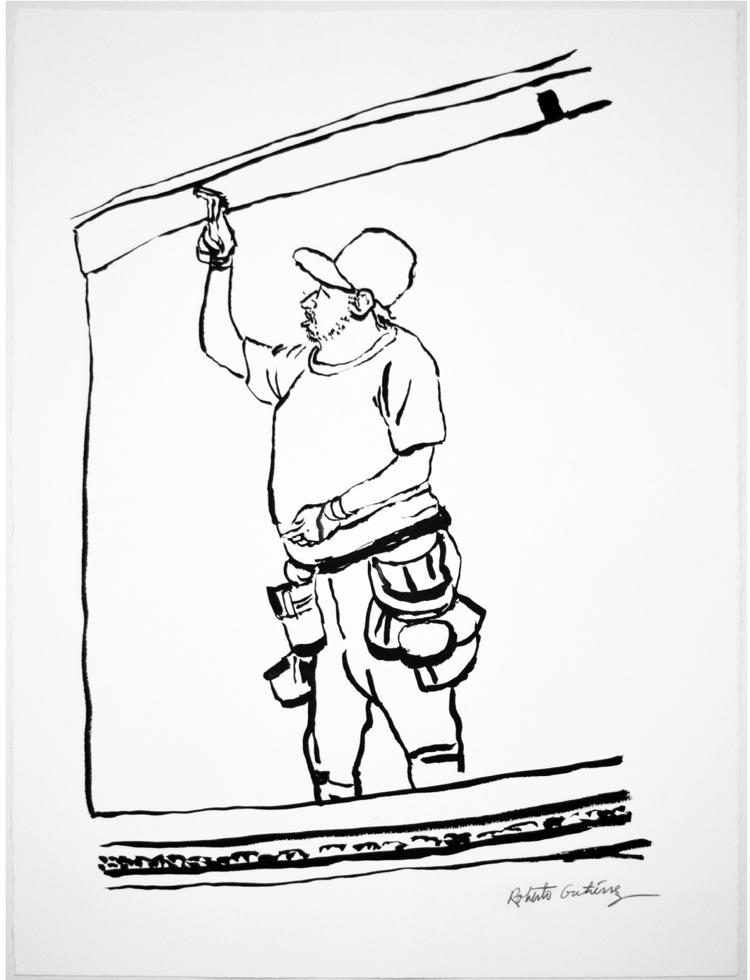
Untitled 6, 2022 Sumi ink on paper 30 x 22 in.