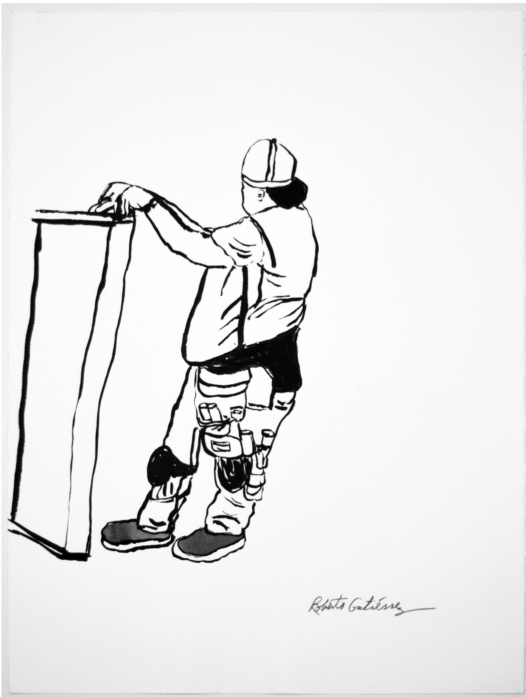
Untitled 15, 2022 Sumi ink on paper 30 x 22 in.