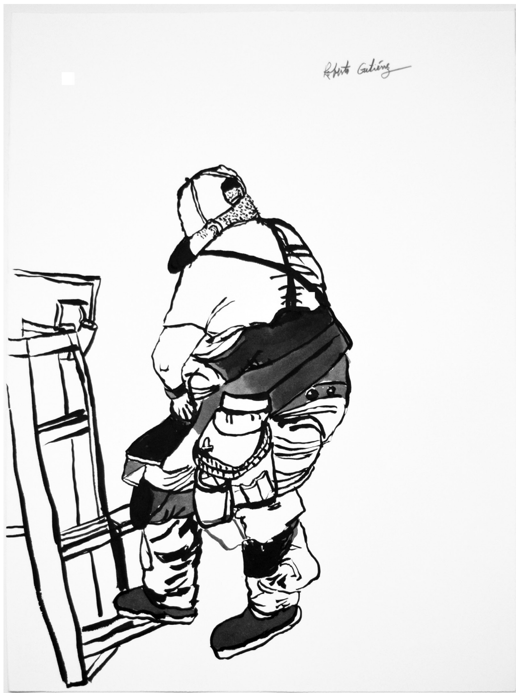
Untitled 16, 2022 Sumi ink on paper 30 x 22 in.