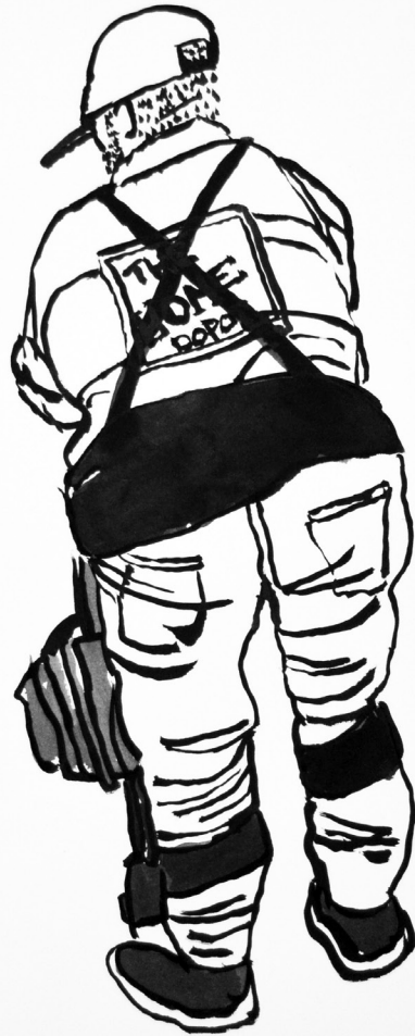
Untitled 18, 2022 Sumi ink on paper 30 x 22 in.