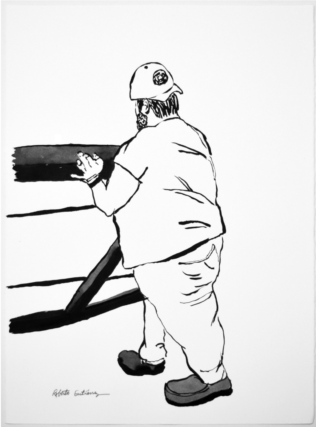
Untitled 7, 2022 Sumi ink on paper 30 x 22 in.