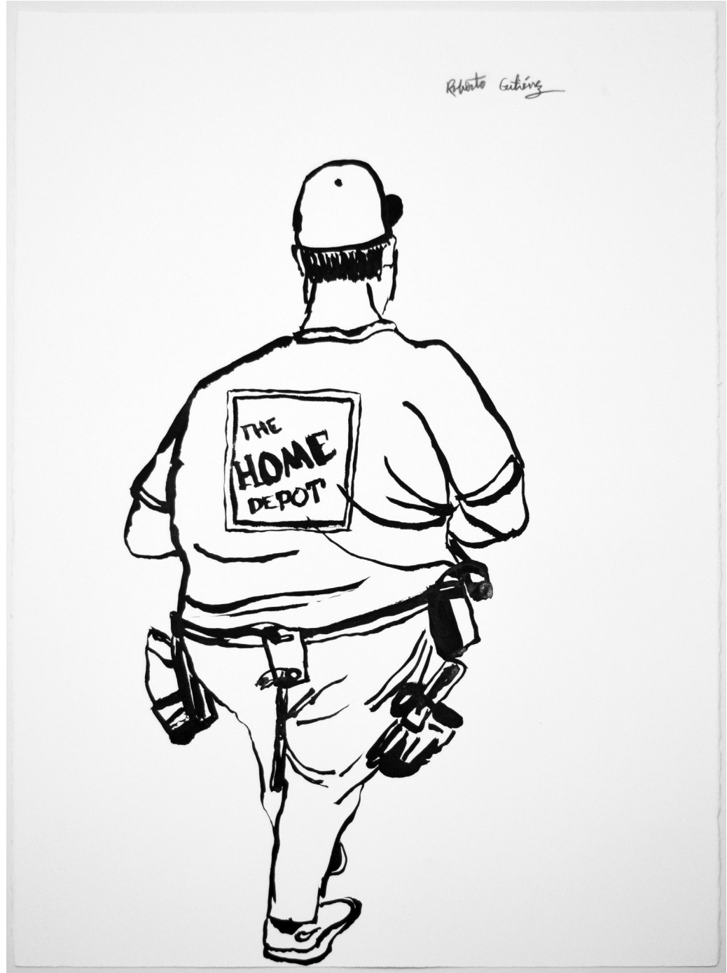
Untitled 10, 2022 Sumi ink on paper 30 x 22 in.