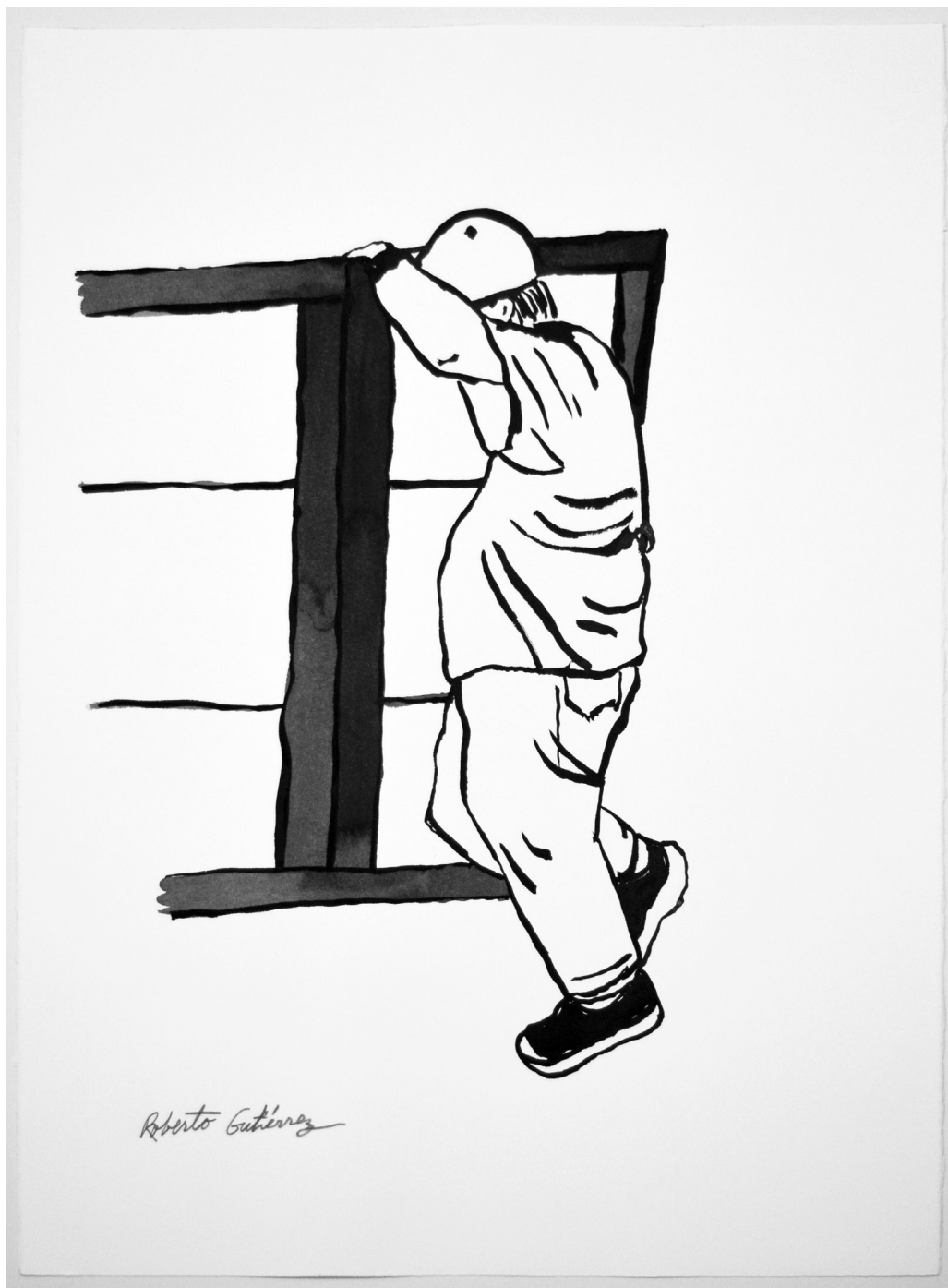
Untitled 2, 2022 Sumi ink on paper 30 x 22 in.