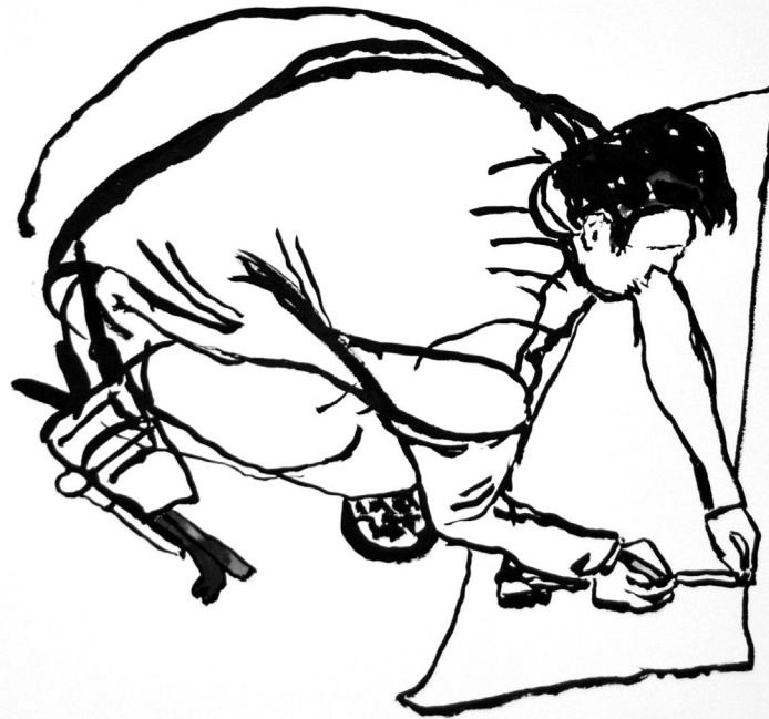
Untitled 5, 2022 Sumi ink on paper 30 x 22 in.