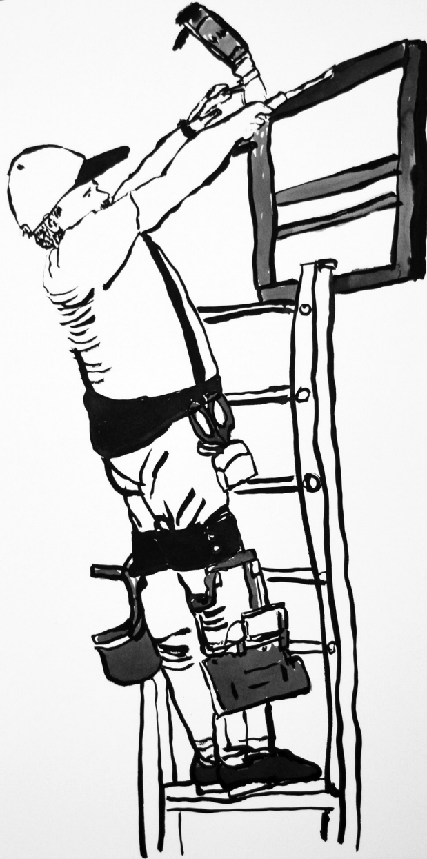
Untitled 9, 2022 Sumi ink on paper 30 x 22 in.