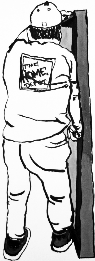
Untitled 3, 2022 Sumi ink on paper 30 x 22 in.